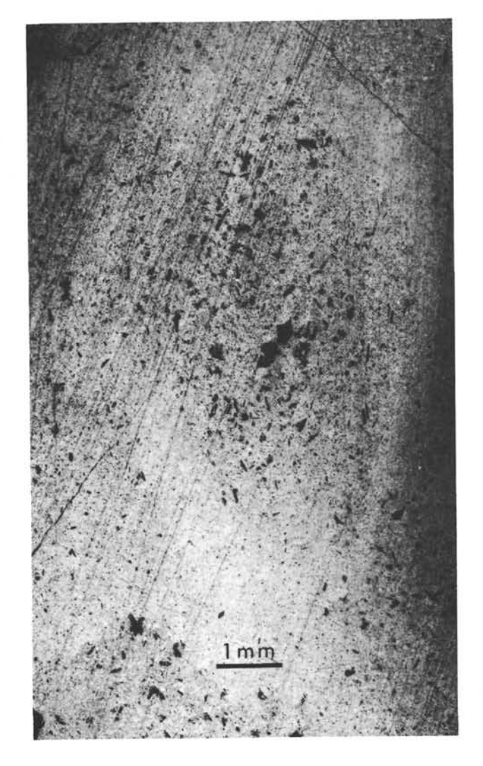
Figure 2. Reverse print of a metabasalt (spilite) from a drill bit sample. The dark patches are porphyritic and glomeroporphyritic clusters of plagioclase accompanied by chlorite pseudomorphs set in a very fine-grained matrix of acicular feldspar, chlorite, and alteration products. Relic crystal outlines suggest that olivine, now replaced by chlorite, was originally present.