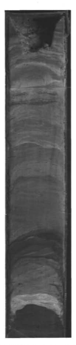
VARICOLORED CLAY and MARL OOZE 136-8-2, 0-37 cm