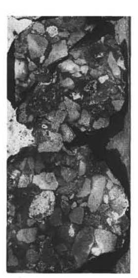
SITE 469, CORE 33, SECTION 1, 94–106 cm