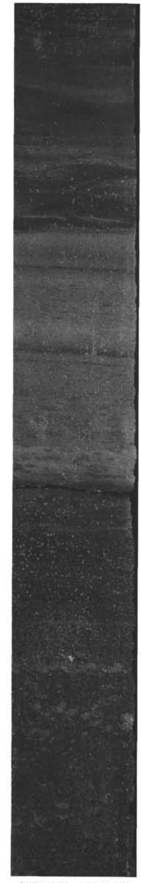
SITE 467, CORE 79, SECTION 2, 60-100 cm