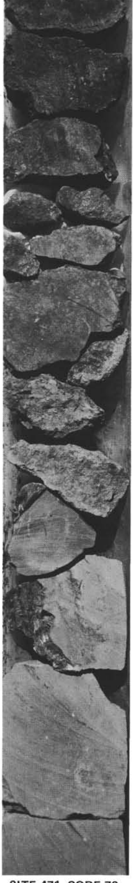
SITE 471, CORE 79, SECTION 1, 70–110 cm